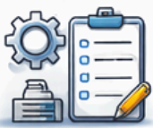
Standards & Compliance